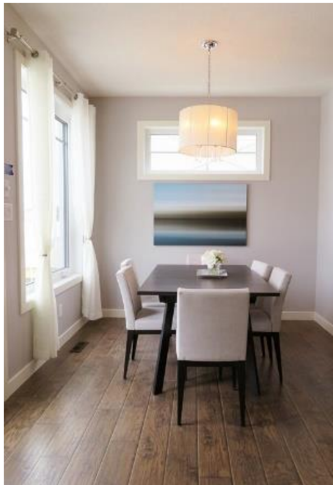
table chair light curtains