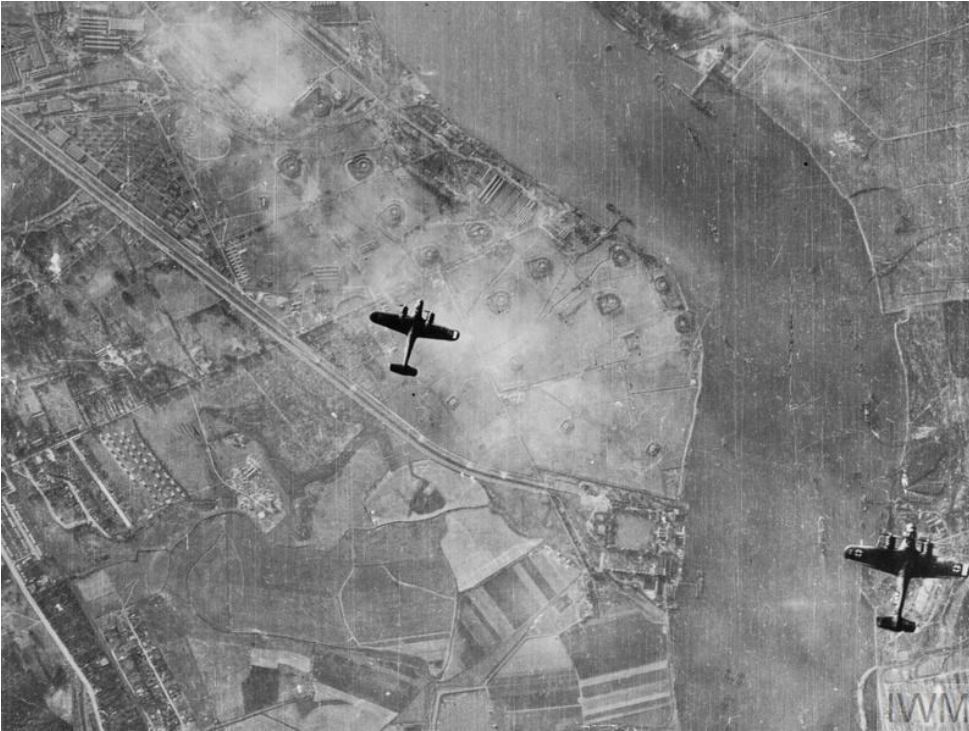
Two German bombers fly over south-east London on the first day of the Blitz, 7 September 1940.