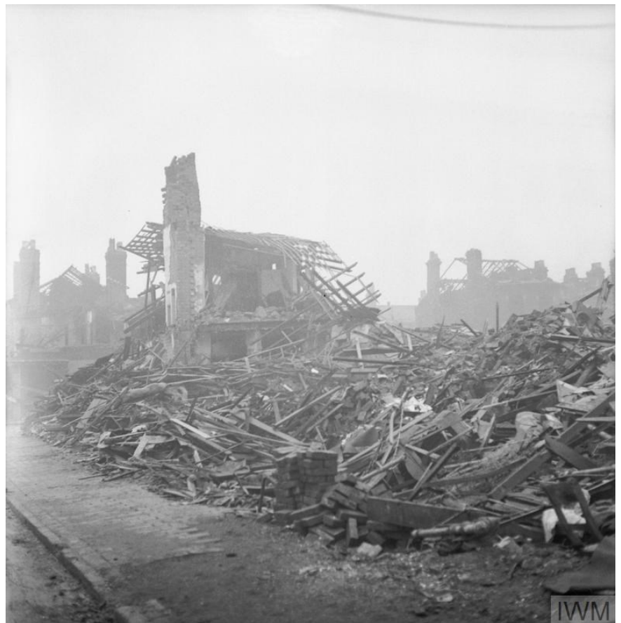
One badly damaged house still stands amidst the piles of timber and rubble following an air raid on Queen's Road, Aston, Birmingham, on 11 December 1940.