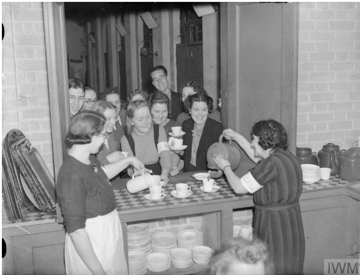
Volunteers prepare to distribute tea to people taking shelter in North London.