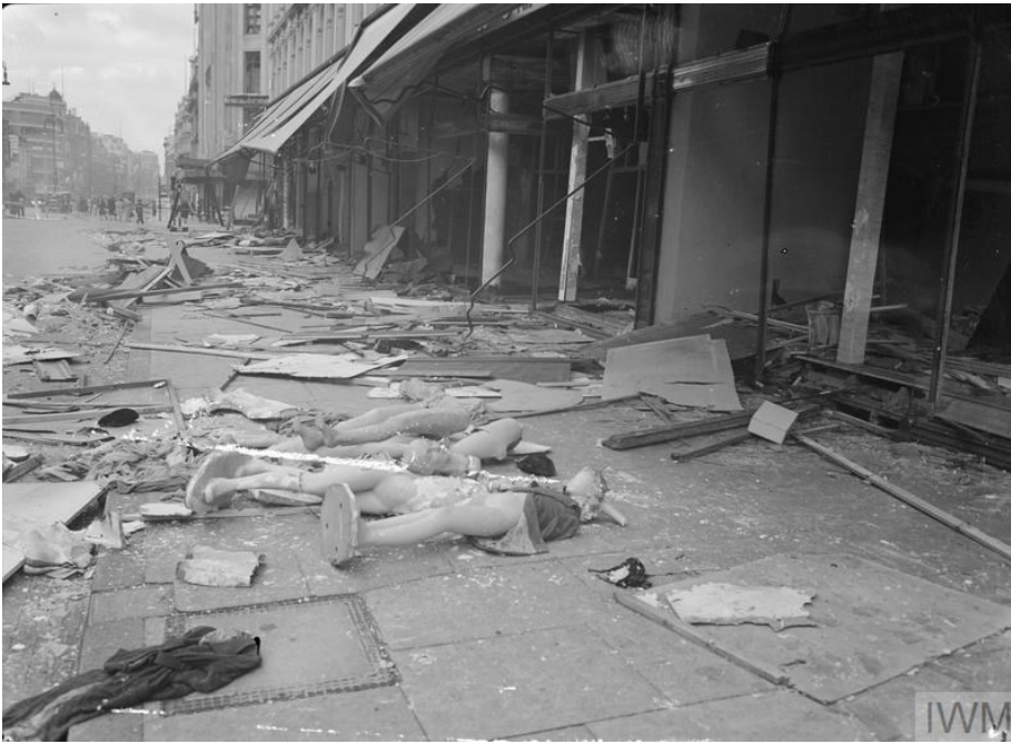
Mannequins litter the pavement outside the John Lewis department store on London's Oxford Street after an air raid in September 1940.