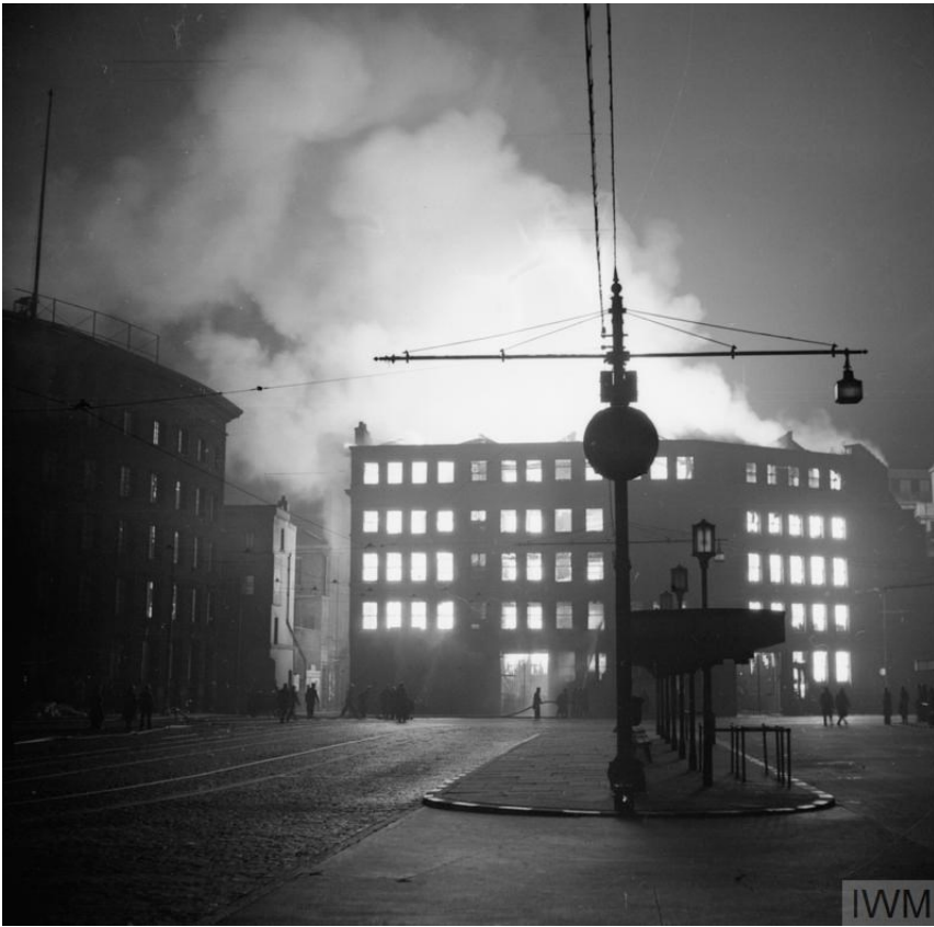
Buildings in Manchester burn after an air raid on the night of 23 December 1940.