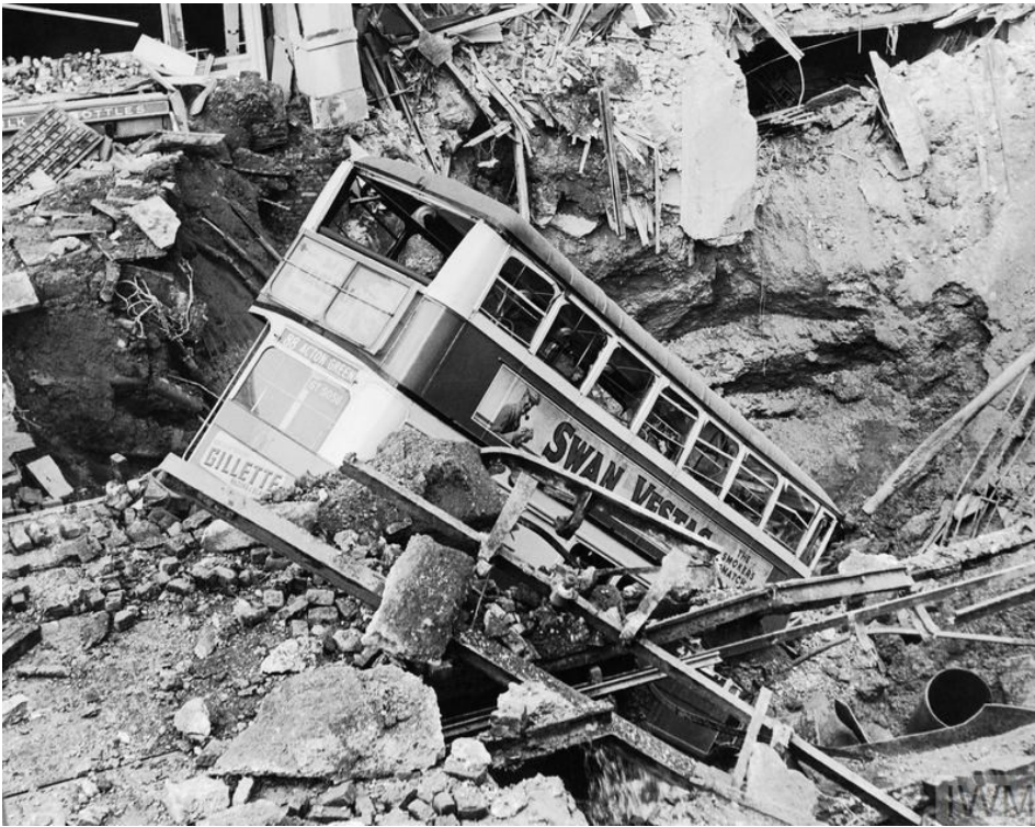
A bus lies in a crater in Balham, south London, after a bombing raid.