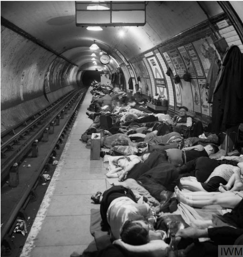
Civilians take shelter in Elephant and Castle Underground Station in south London during an air raid in November 1940.