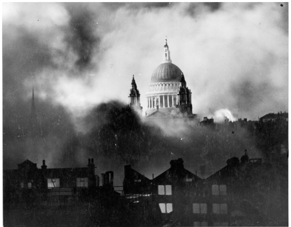
St Paul's Cathedral seen through smoke caused by a bombing raid on London in December 1940.