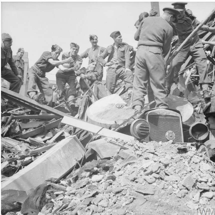
Troops of 9th Battalion, The Hampshire Regiment, clear bomb damage in Hull sustained during the Blitz.