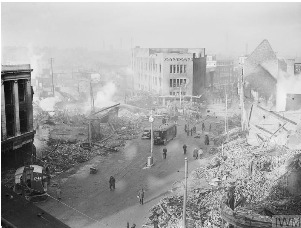
Bomb damage in the centre of Coventry after the devastating German air raid on the night of 14 November 1940.